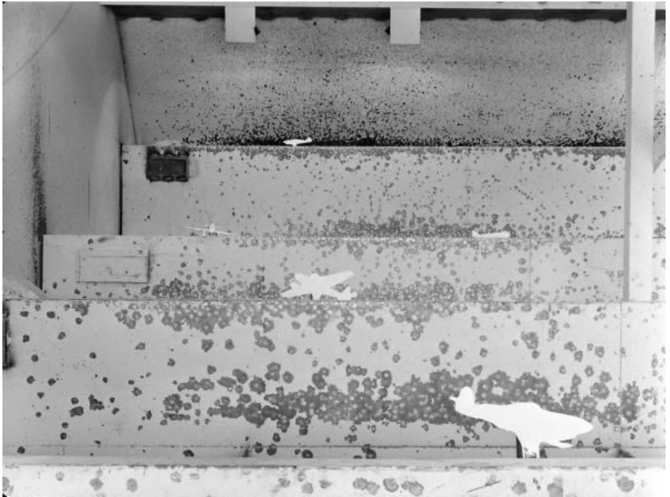
MILITARY VERSION OF SHOOTING GALLERY AT THE FAIR