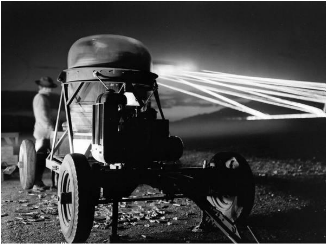
TIME LAPSE OF FIRING AT THE TROLLEY