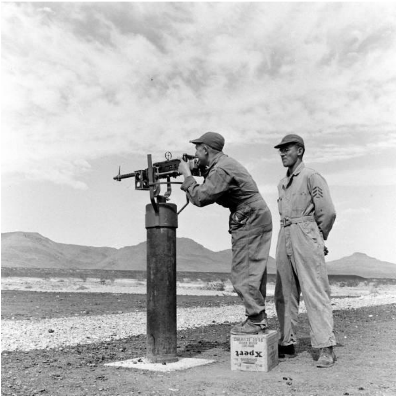
OUT ON THE FIRING LINE