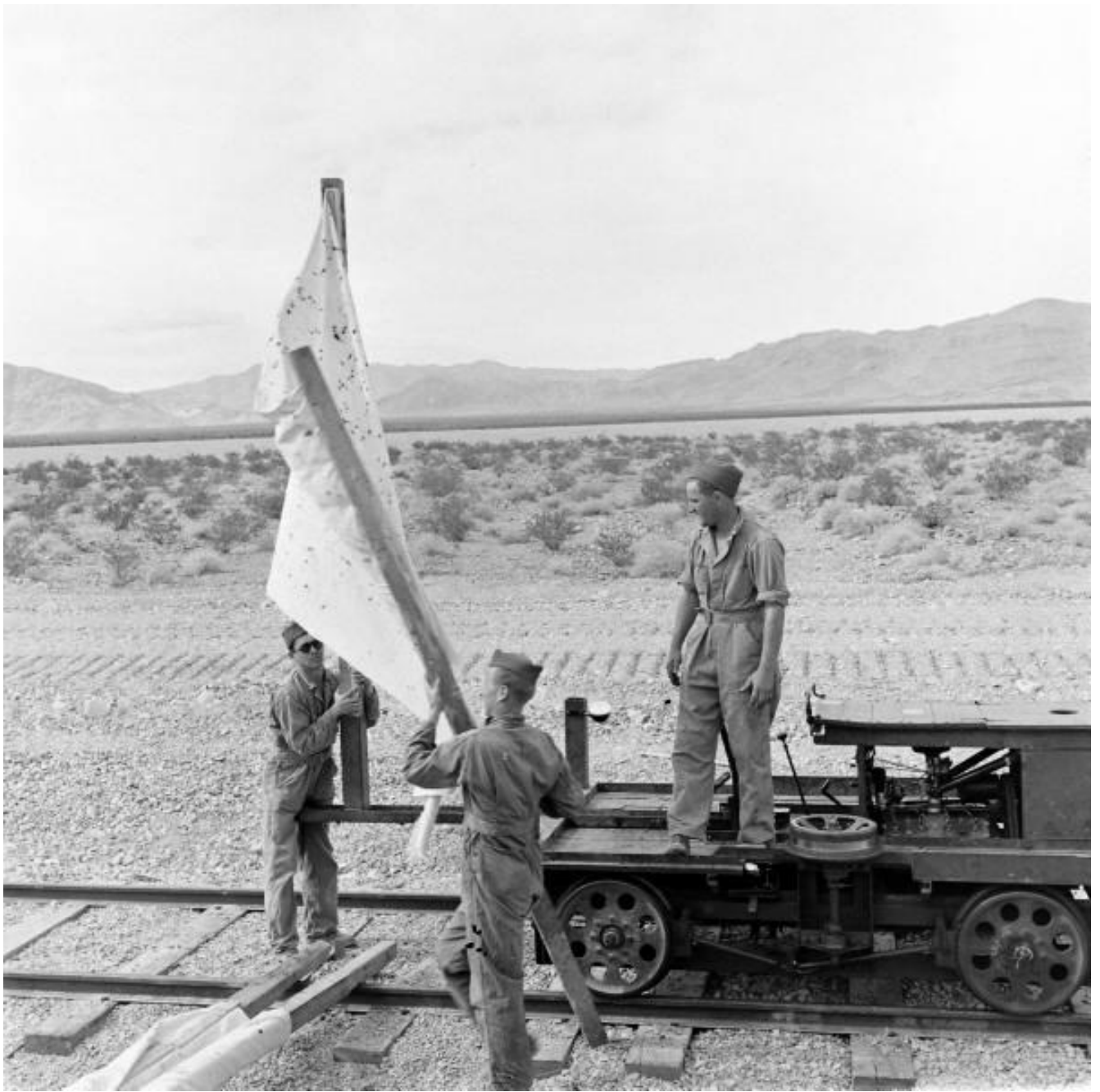
A TROLLEY TARGET WHICH MOVED IN FRONT OF THE STUDENTS