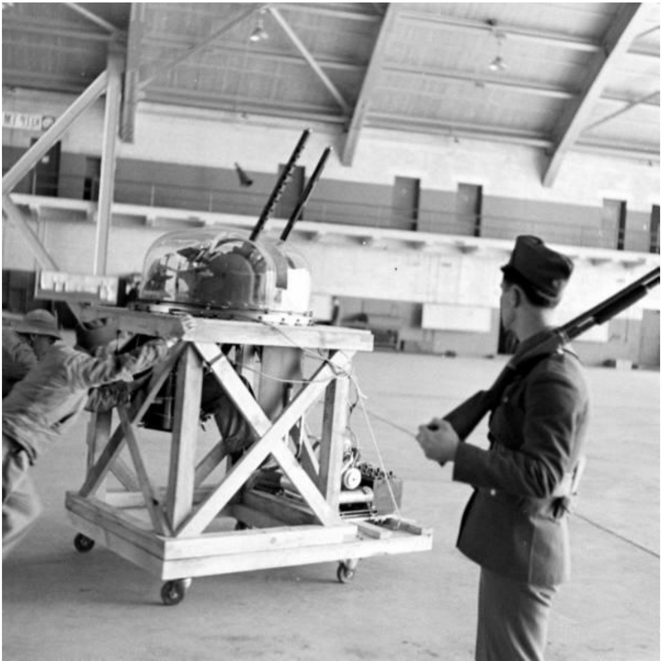
A PRACTICE TURRET