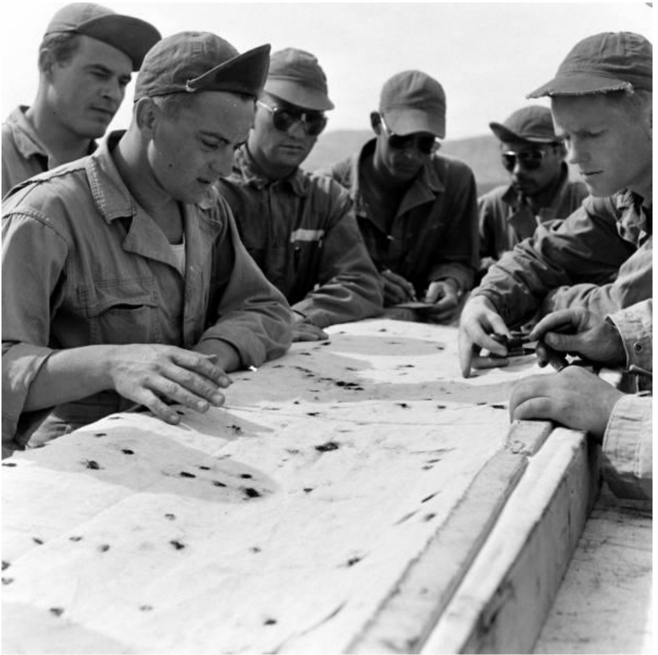
CHECKING THE TOWED SLEEVE TARGET