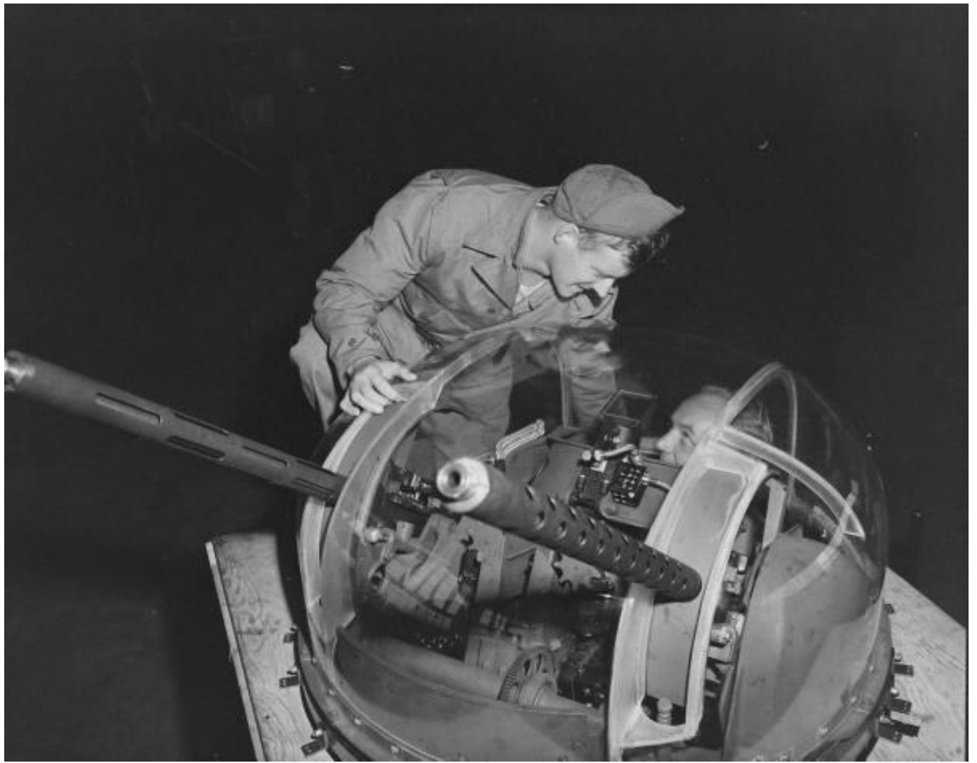
STUDENT IN THE TURRET