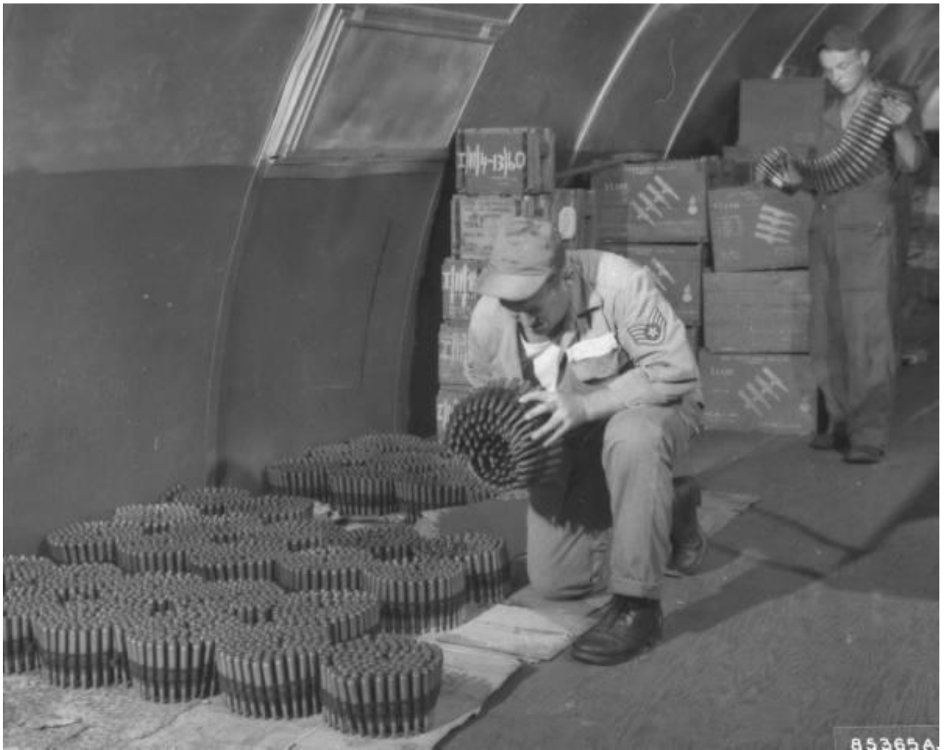
THE AMMO SHED