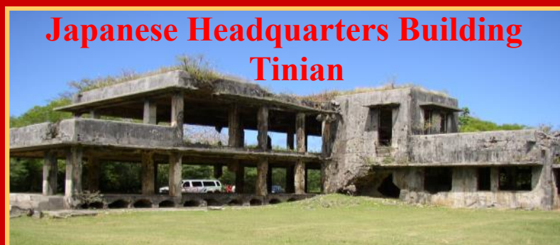
Japanese Headquarters Building Tinian