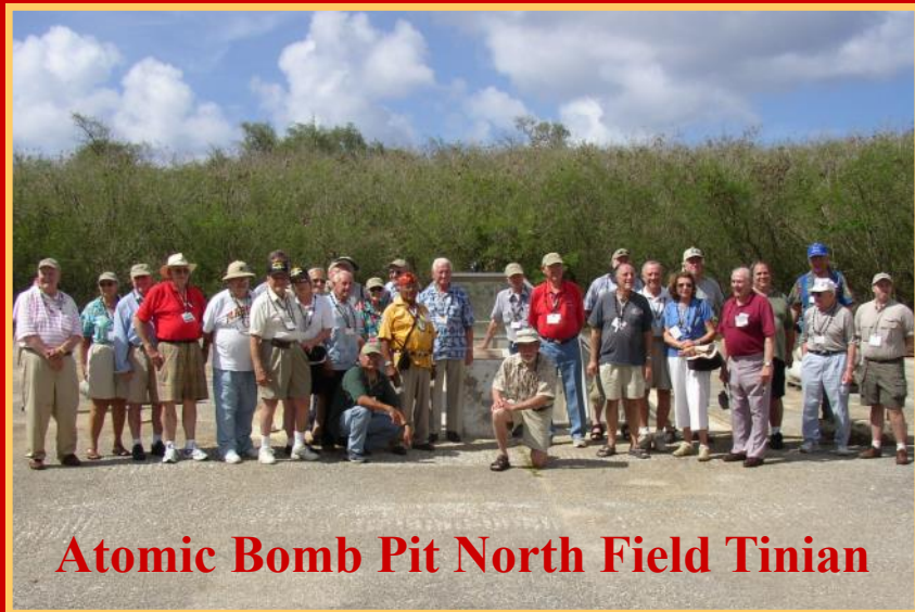
Atomic Bomb Pit North Field Tinian