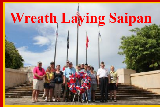
Wreath Laying Saipan